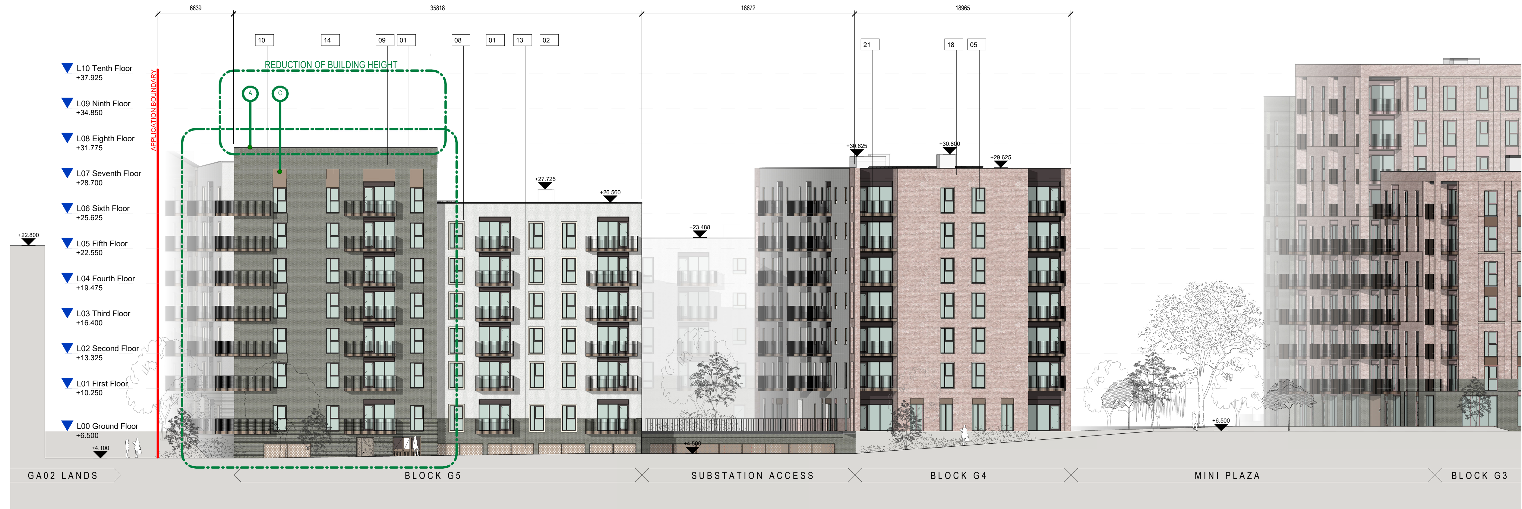
NORTH ELEVATION 1:200