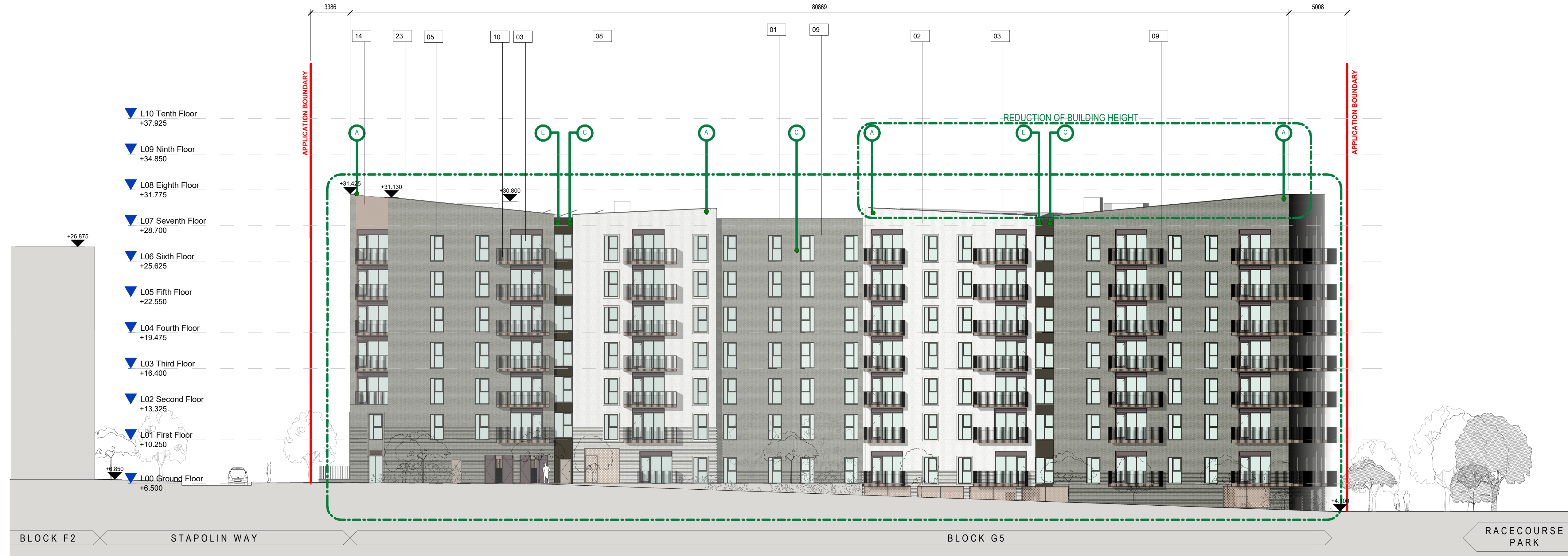
EAST ELEVATION 1:200

Architecture + Interiors henryjlyons.com +353 1 888 3333 info@henryjlyons.com 51-54 Pearse Street Dublin D02 KA66