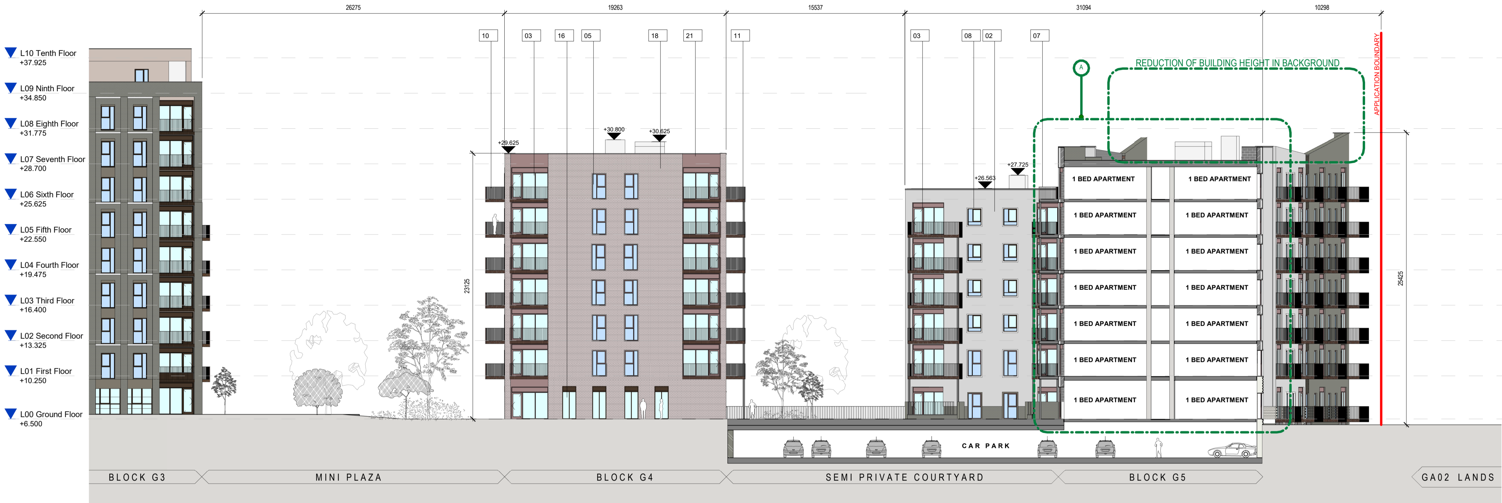
SECTION / ELEVATION CC 1 1:200