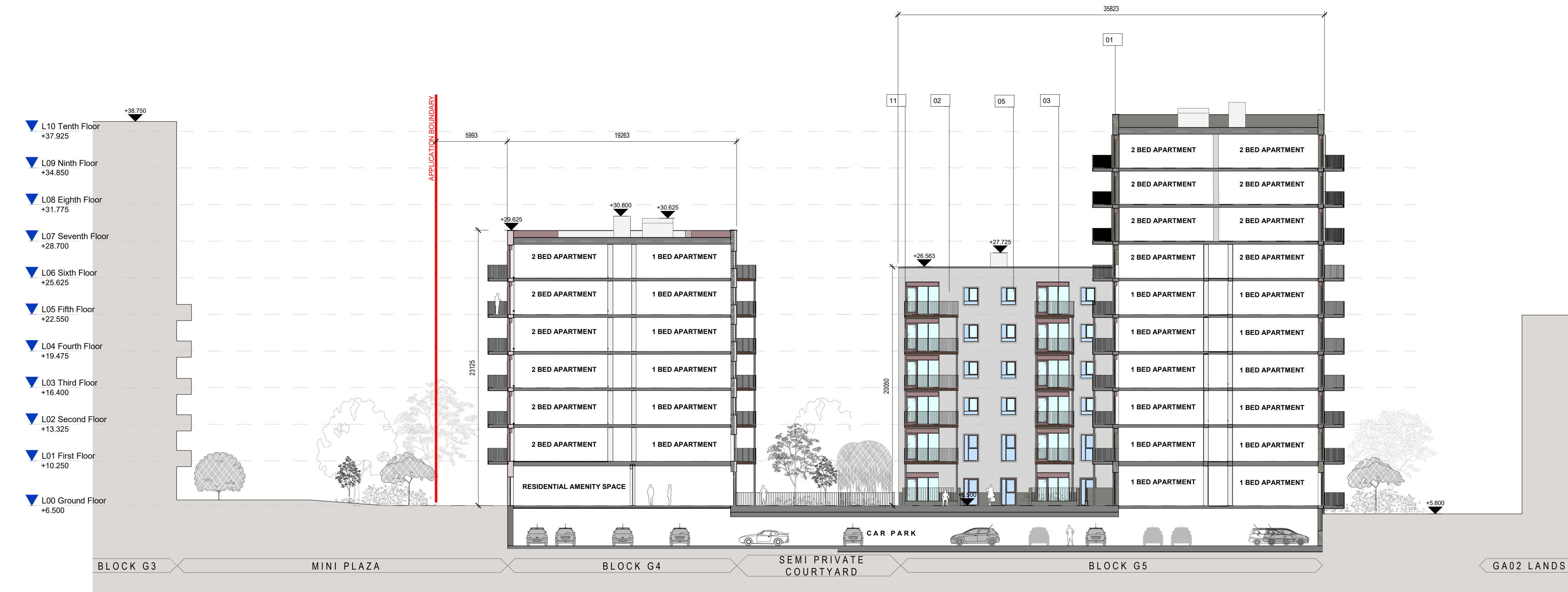
SECTION / ELEVATION AA 1:200