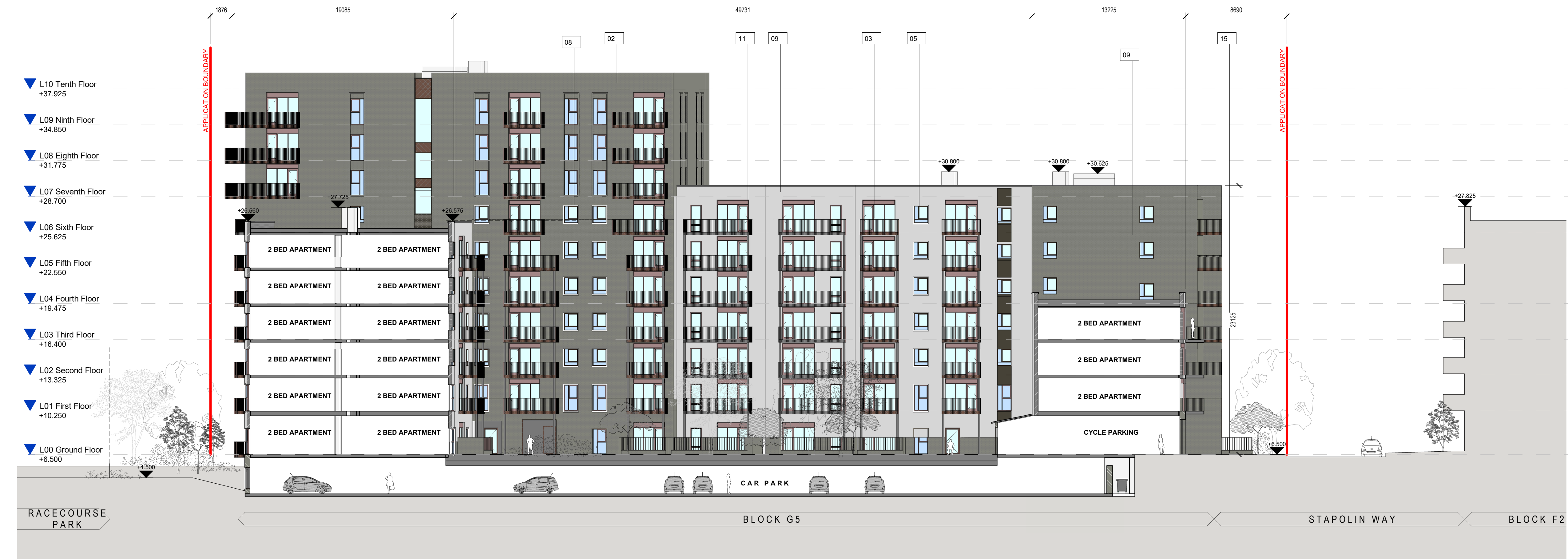
SECTION / ELEVATION BB 1:200