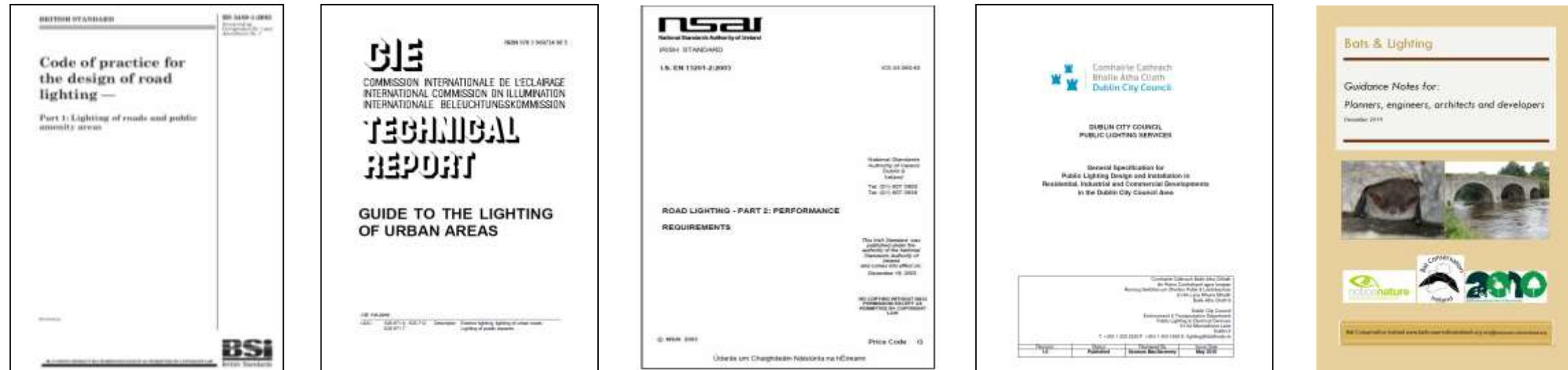
Figure 2.1 - Lighting Design Guides

The design criteria applied to the proposed external lighting installations is in accordance with BS 5489-1:2003 Code of practice for the design of road lighting 1 , CIE Guide to the Lighting of Urban Areas 2 , NSAI EN I.S. 13201-2 Road Lighting Performance Requirements 3 , General Specification for Public Lighting Design and Installation in Residential, Industrial and Commercial Developments in the Fingal County Council Area 4 . The guidelines in “Bats & Lighting, Guidance Notes for Planners, engineers, architects and developers”, issued by Bat Conservation Ireland were also taken into account in the design of lighting.