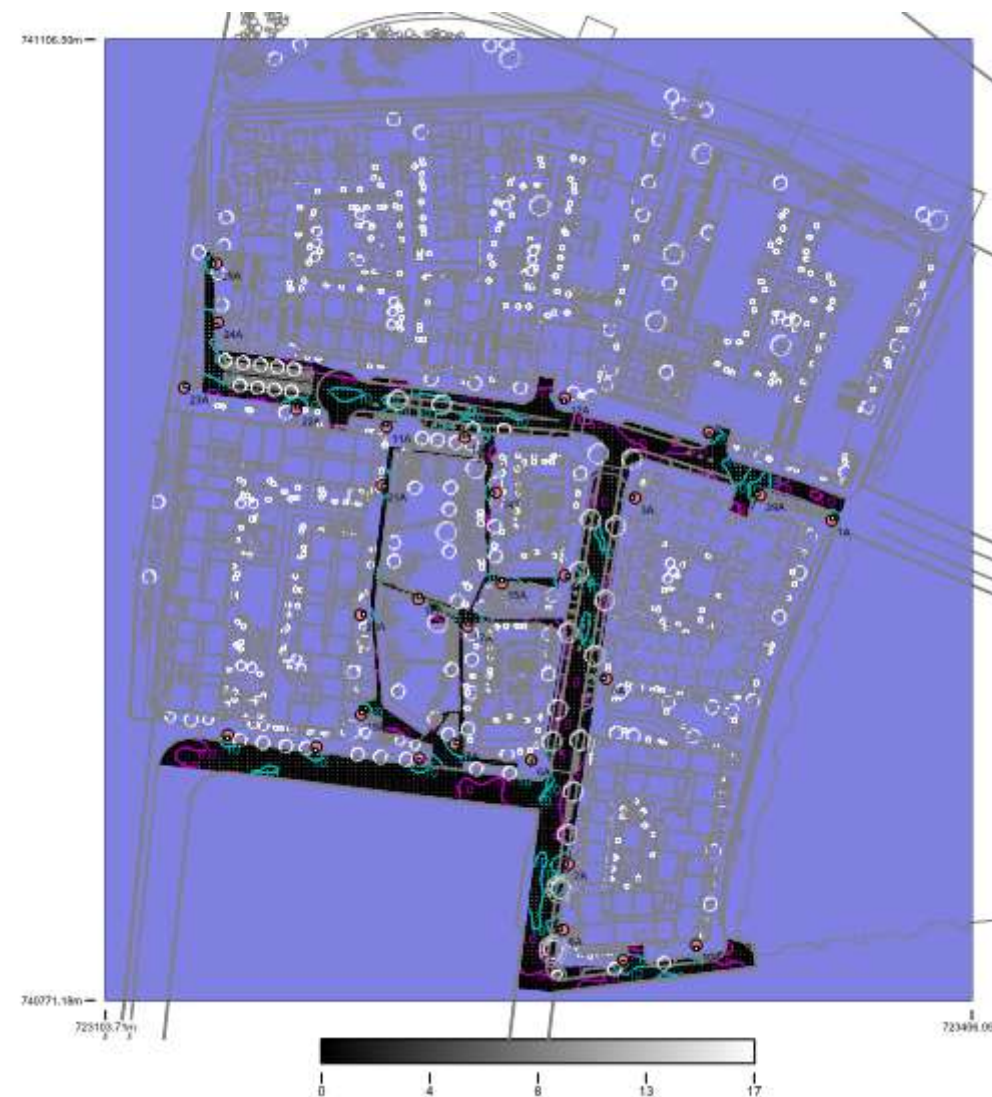
Figure 4.2 - Calculation results for the Illumination Levels (Lux) for the Residential Development

Figure 4.2 illustrates the predicted illumination levels on Ground for the proposed installations. Illumination is indicated using a grey-scale rendering. As shown in Figure 4.1 the illumination throughout the residential development meets the requirements of P2, P3 and P4 Classifications. It should be noted that the illustration shows the design intent only. The luminaire positions will be installed as per the OCSC drawing to ensure that light spill on the park complies with an E2 zone, and to ensure P2, P3 and P4 Classifications are adhered to on the roads within the development. The detailed results are illustrated further on drawing no. R500-OCSC-GA03-XX-DR-E-0100.